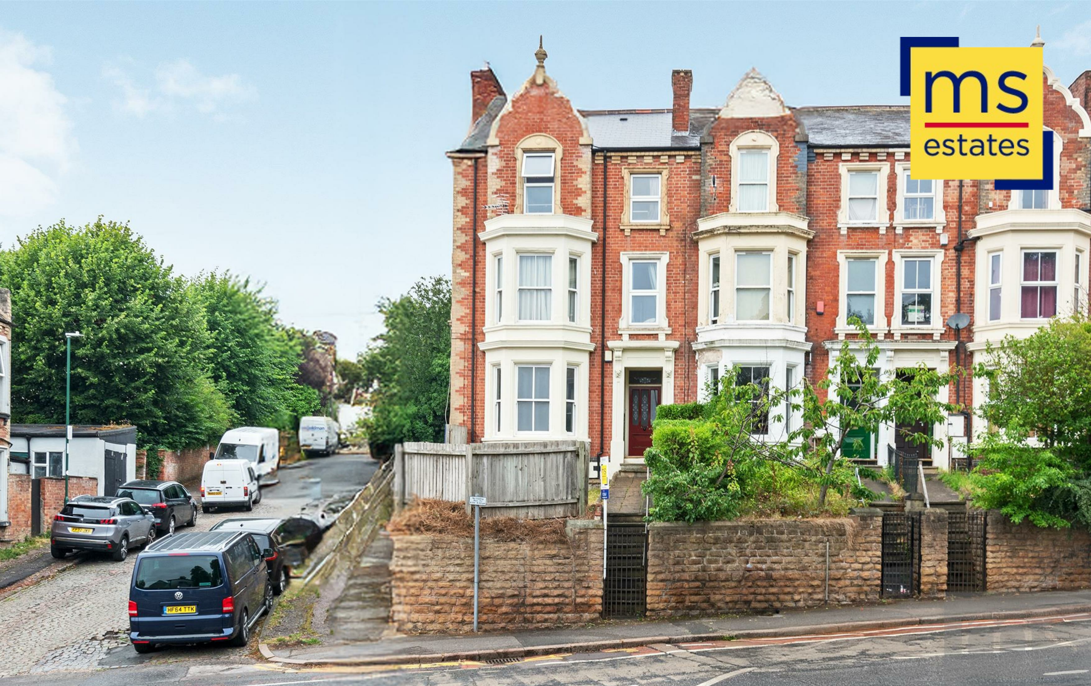
269 Woodborough Road, Nottingham, NG3 4JZ Price Guide £399,000